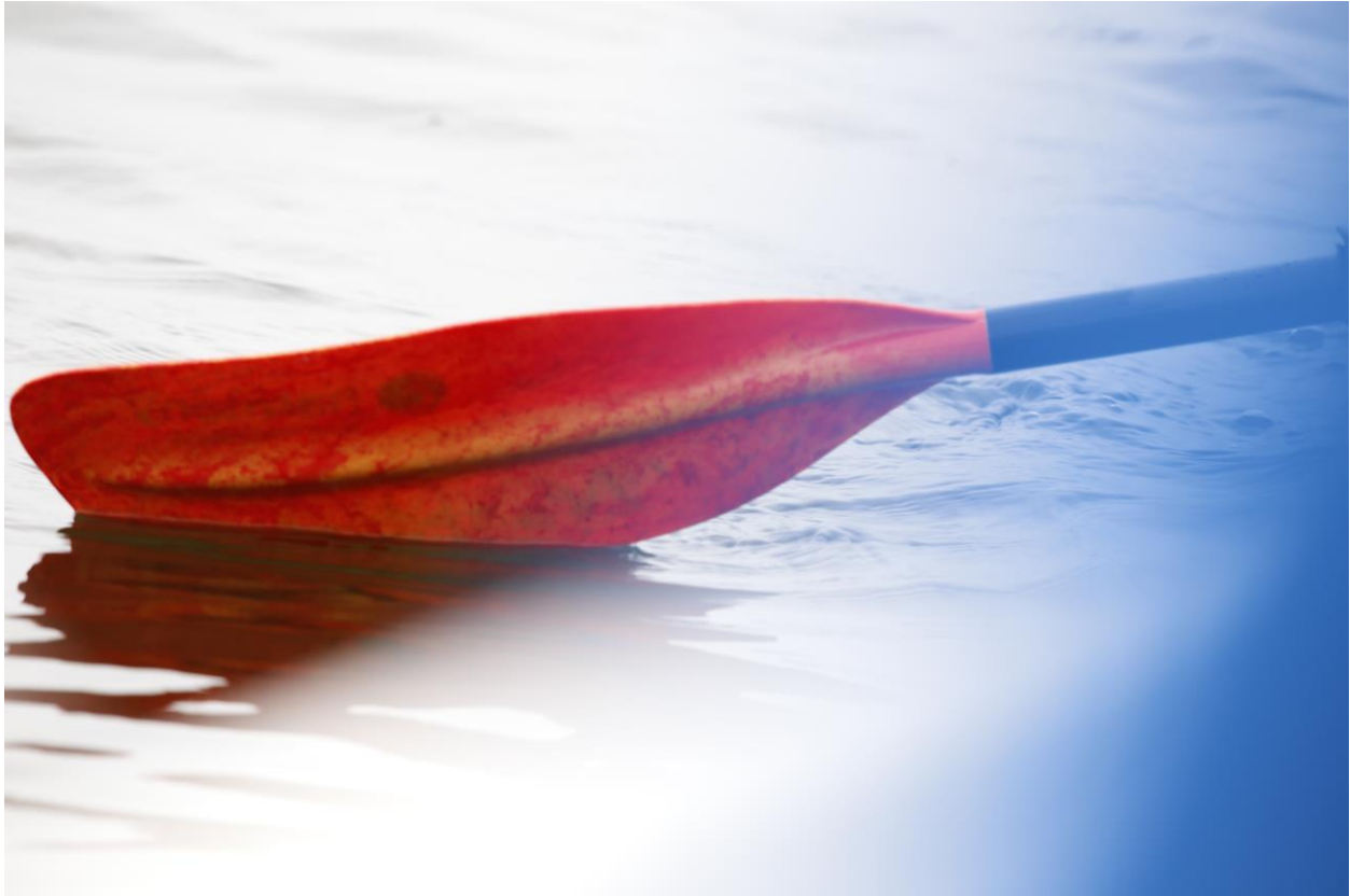
11th Place Kayak Paddle

scut-tle-butt 1 a: a cask on shipboard to contain fresh water for a day's use b: a drinking fountain on a ship or at a marine installation