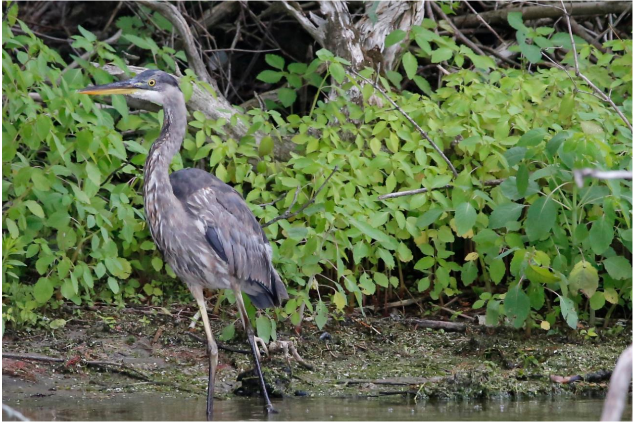
5th Place Heron on Shore

scut-tle-butt 1 a: a cask on shipboard to contain fresh water for a day's use b: a drinking fountain on a ship or at a marine installation