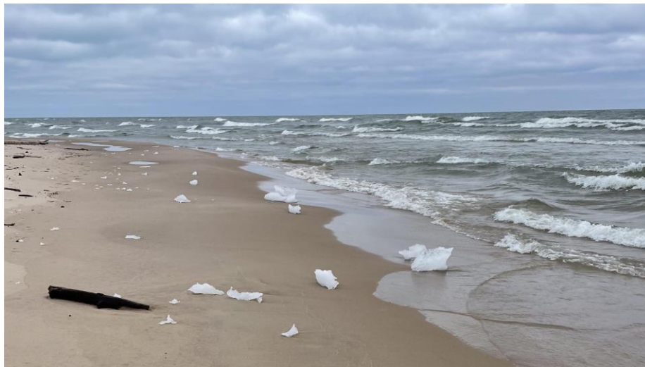
Lake Michigan just north of Muskegon on February 11, 2024. Although chunks of ice dot the sandy beach, there is little-to-no ice coverage on the lake. Often in February ice would be many inches thick at this same location and the waves would be well off shore.

A sandy beach is dotted with chunks of ice. The waves are hitting the beach and there is no ice out on the water.