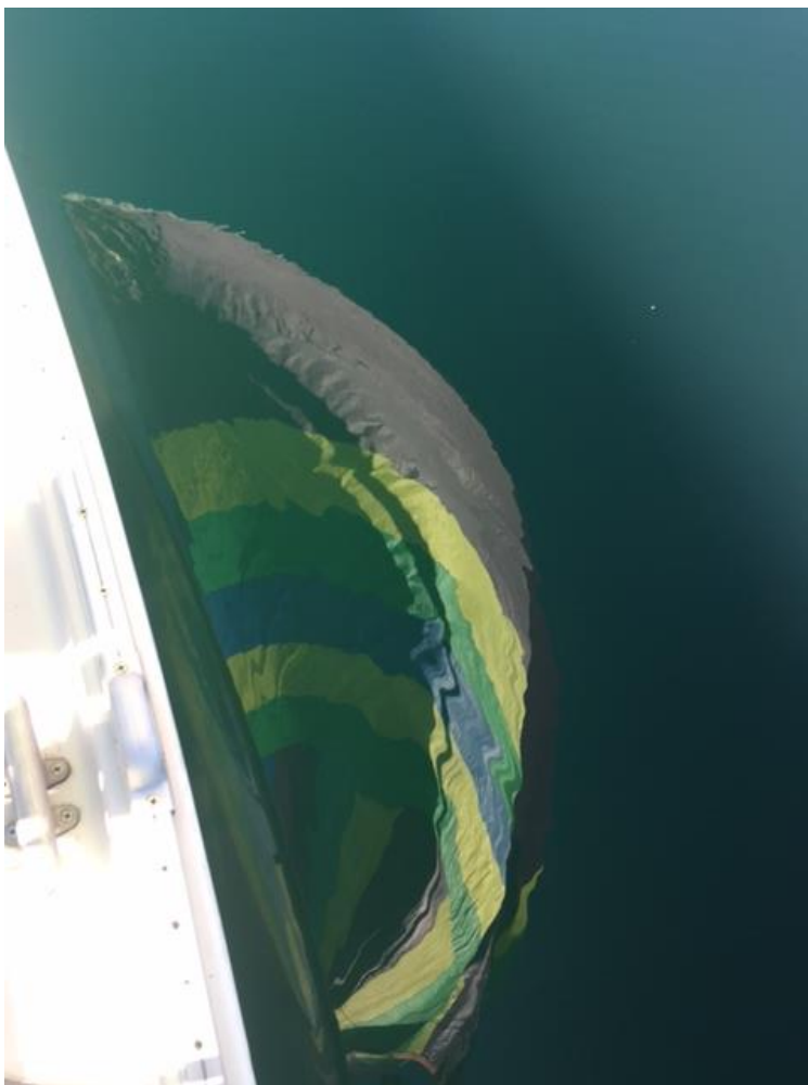
6th Place Heron on Shore

scut-tle-butt 1 a: a cask on shipboard to contain fresh water for a day's use b: a drinking fountain on a ship or at a marine installation