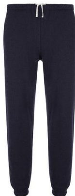
Sweatpants Ladies, Men, Youth