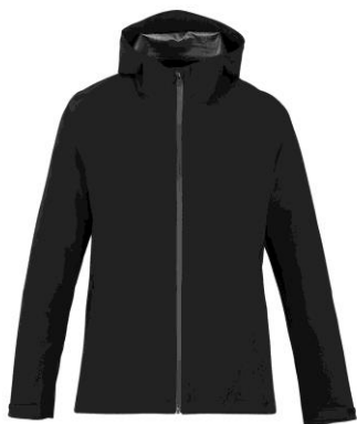
Rain Jacket with Hood Ladies and Men