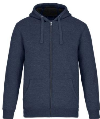
Full Zipper Sherpa Lined Hoodie Ladies and Men