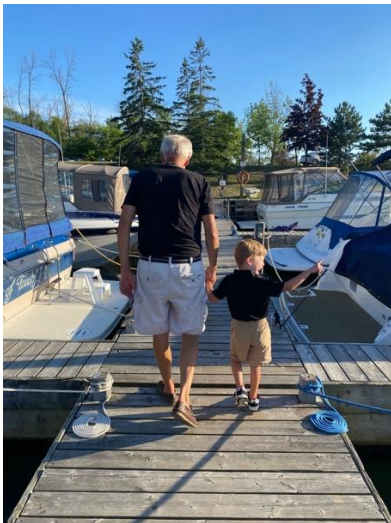
Dock walks with my buddy