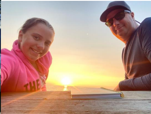
Amazing Sunsets with the family