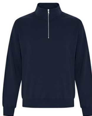
Quarter Zip Sweatshirt Unisex