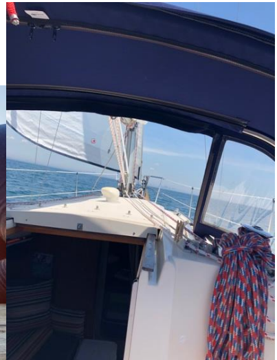
Breezy Days on the water